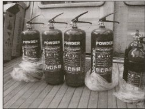
Fire extinguishers 6 kg