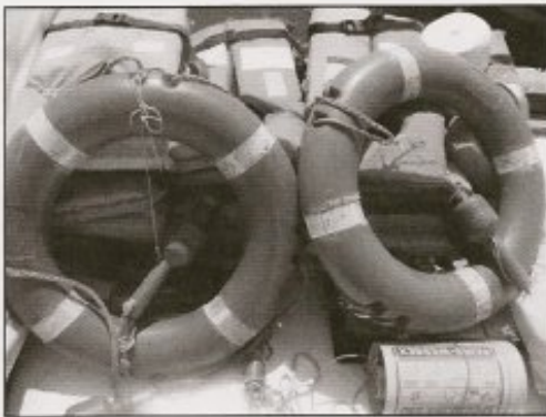
Life buoys w/ line & light