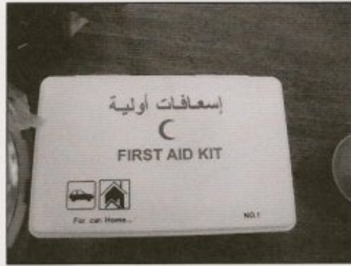
First aid kit