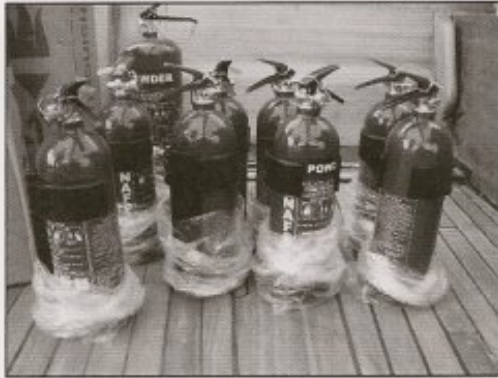
Fire extinguishers 2 kg