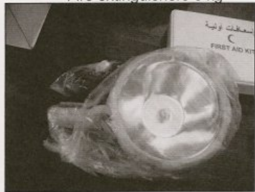
Portable hand light